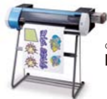
Optional Stand PNS-24